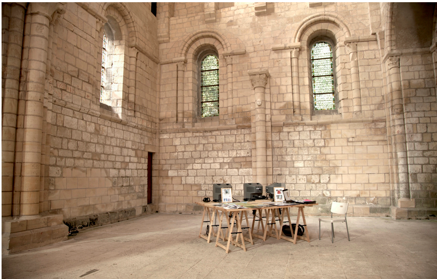
Documentation table with three monitors, DVD players, maps, images, framed drawings