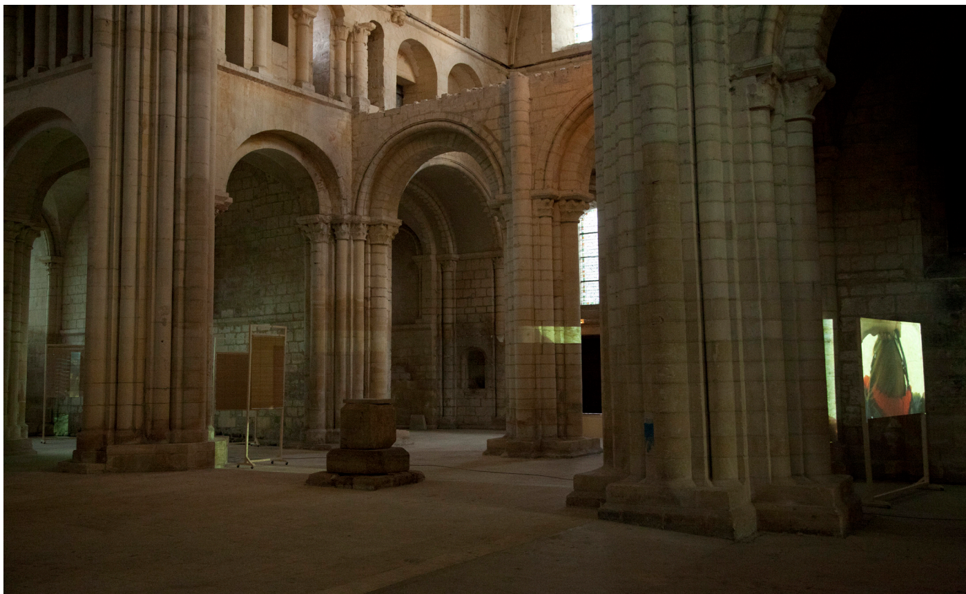
Nave, general view of St Nicolas Church from the entrance